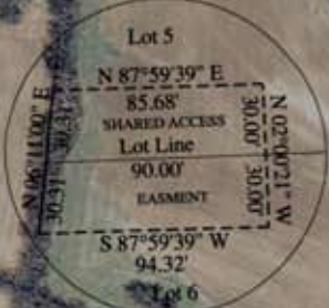
DETAIL 'A' Scale 1" = 40'